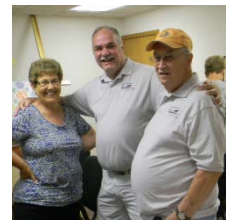
Scheduled: Summer Meeting