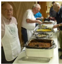
Scheduled: Soup Supper