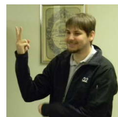
2018 Winter General Meeting Photos