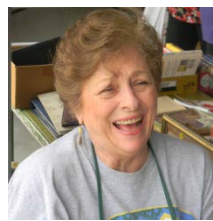
Scheduled: Garage Sale