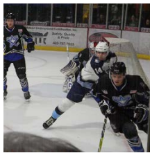
Scheduled: Stars Hockey