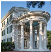
Scheduled: Arbor Lodge