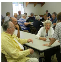
Scheduled: Fall Carnival