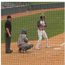
Scheduled: Saltdogs Baseball