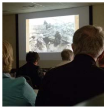
Scheduled: Spring Meeting