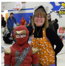
Scheduled: Trunk or Treat