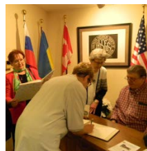
Scheduled: Christmas Open House